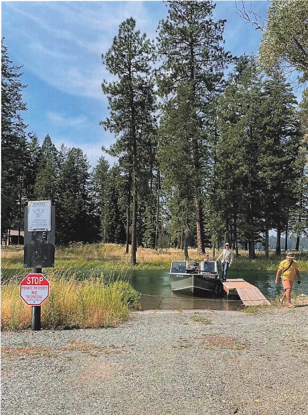
Photo from shore of launch/cable/private property sign