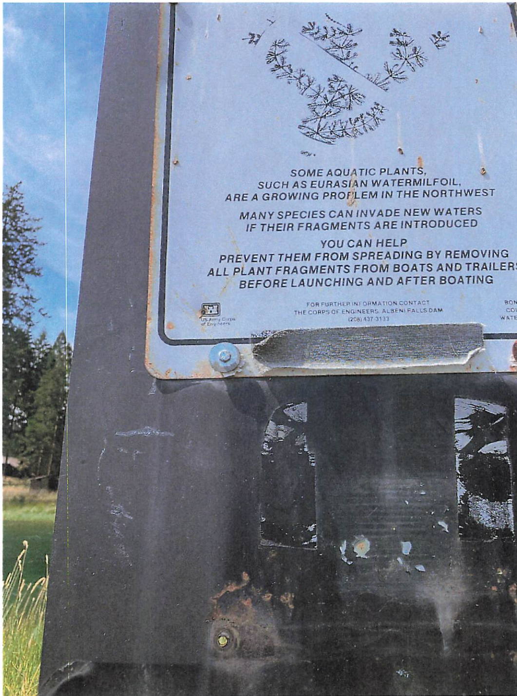
Photo of existing sign at launch with Corps of Engineers logo